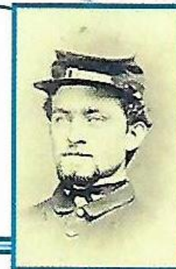
Images of Otter Tail County's last surviving Union Civil War veteran, James Allison "Cap" Colehour, who died in Battle Lake in 1938.